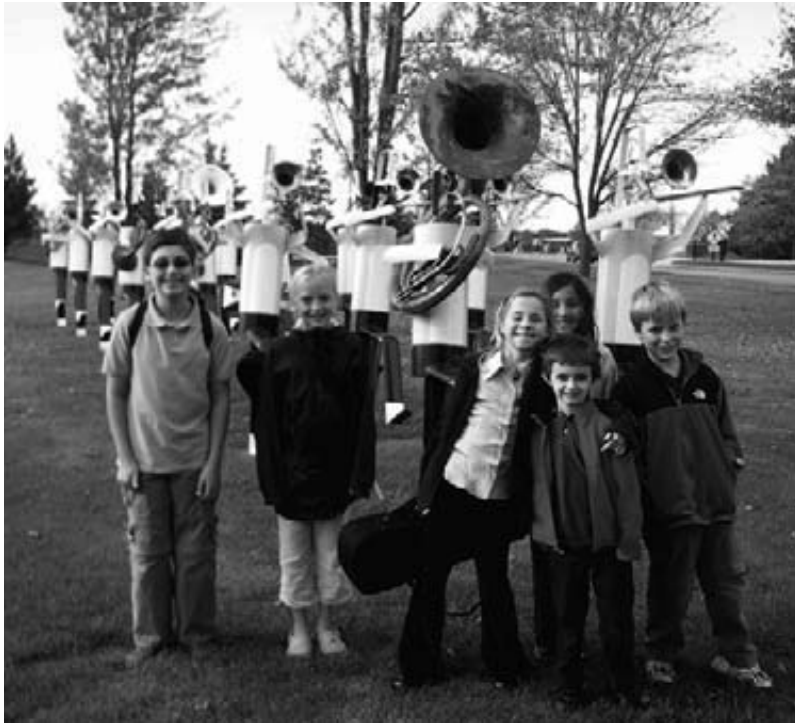
the Suzuki tour group at Grand Valley State University by the Marching Band Art Sculptures.