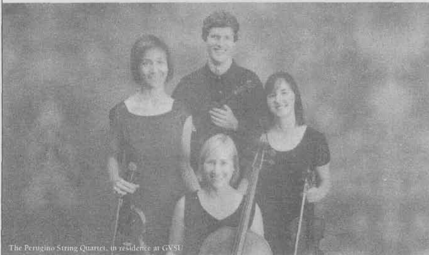
The Perugia String Quartet, in residence at GVSU

Whether your goal is to become a performer, music educator, composer, or scholar, study at Grand Valley can equip you with the tools you need for success in your chosen field. We are eager to help you develop your artistic potential, stretch your abilities, and explore new realms of artistic expression.